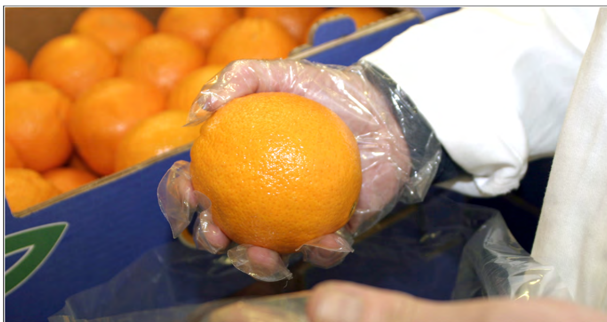
Figure 3: Fruit samples being selected for analysis within the Pesticide Control Laboratory.

The enforcement sampling strategy involves sampling of food commodities from specific sources where non-compliance with pesticide legislation is suspected or has been detected previously. It includes Import Controls Regulation (EC) No. 669/2009 which lists commodities and countries of origin for additional targeted sampling.