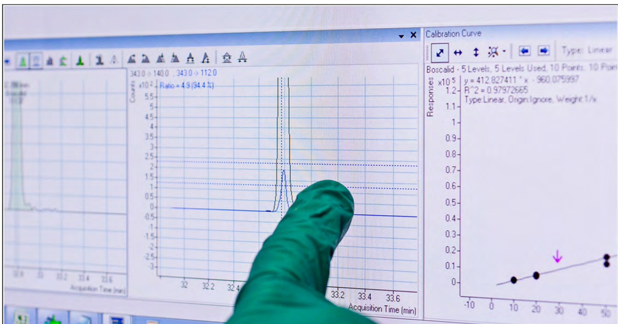
Figure 12: Residue identification and quantitation.

When a residue in a laboratory sample is identified by matching the retention time and the mass spectrum pattern with a standard, the amount of the residue in the sample is then quantified by running it against a series of standard mixtures of known concentrations. A select number of samples are also analysed for other pesticides which cannot be analysed using the multi-residue methods outlined above. These single residue methods (SRM) which may employ different extraction methods are used to analyse such pesticides as amitraz, glyphosate, paraquat and dithiocarbamates.