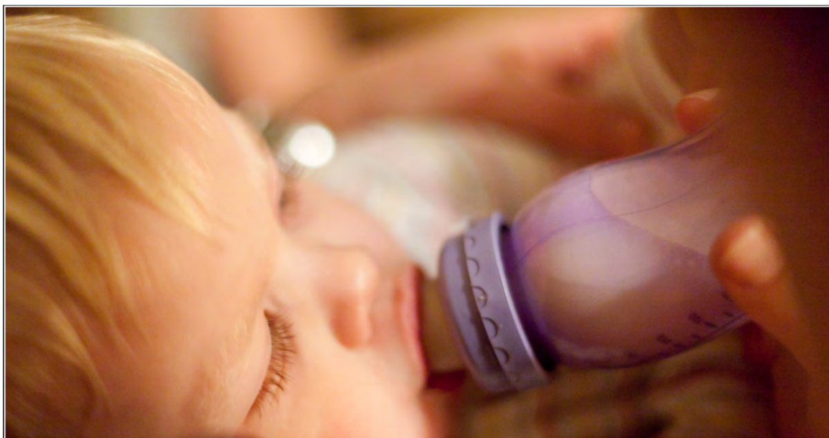
Figure 4: Feeding time with baby infant formula.

The samples were taken by officers of the Dairy Science Laboratory of DAFM. The legislation and the MRLs governing these infant samples are set in Commission Directive 2006/141/EC 6 with MRLs different to those established for the foods of plant and animal origin.