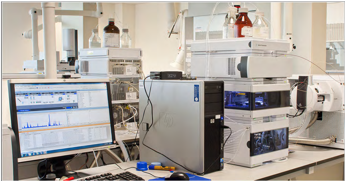
Figure 2: Pesticide Control Laboratory with liquid chromatographic systems for sample analysis.