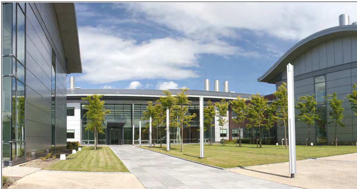
Figure 5: View of the main laboratory complex at Backweston.

All the samples are brought to the Pesticide Control Laboratory which is based at the DAFM Laboratory campus in Backweston, Co. Kildare.