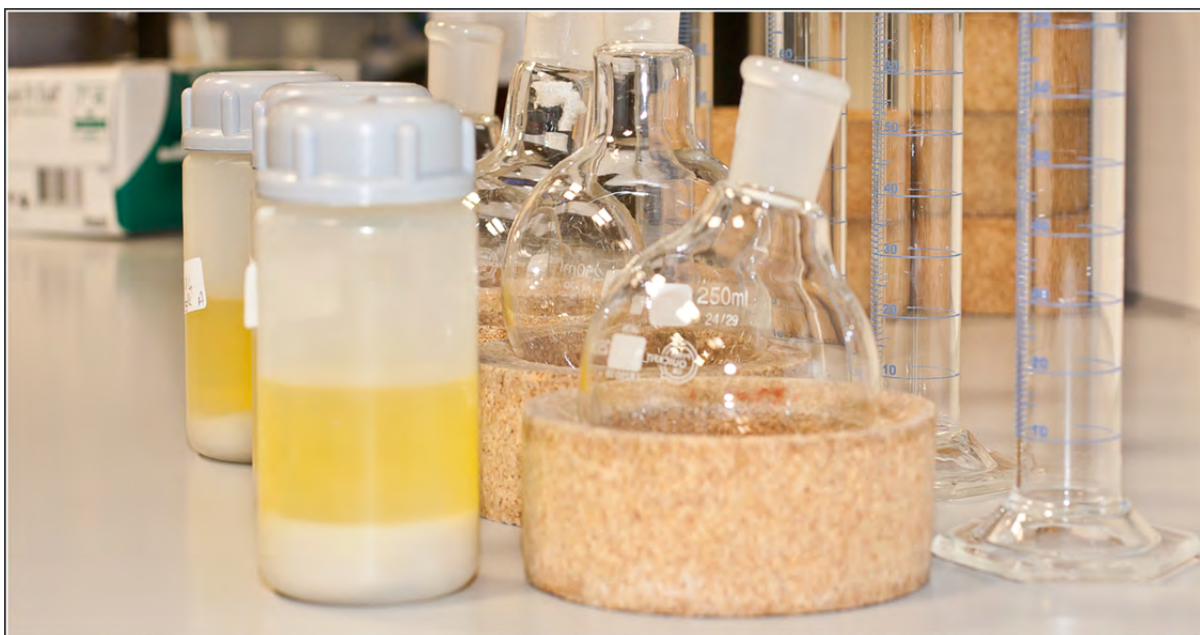
Figure 9: Sample material following the first chemical extraction, ready for clean-up steps.

These analytical techniques allow a large number of pesticide residues to be analysed at the same time. For these multi residue methods (MRM), mixes containing many pesticide standards are injected onto the chromatographic columns and the details of the individual standards eluting from the columns are recorded as unique mass spectral data.