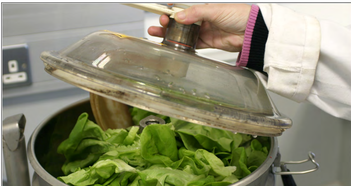
Figure 6: Lettuce sample prior to chopping and blending.

On receipt, the samples are logged into the laboratory system and prepared for residue analysis. The fruit and vegetable samples are blended or ground with dry ice (solid carbon dioxide), put into labelled sample bags and stored in a freezer at -18^{\circ}\text{C} prior to extraction and analysis.