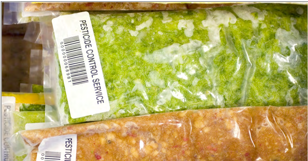
Figure 8: Frozen laboratory samples.

At the extraction stage, the ground up sample is taken out and a measured amount is extracted with organic solvents, cleaned up if required and injected into one of two chromatographic systems- GC/MS/MS (gas chromatography with tandem mass spectrometry) and/or LC/MS/MS (liquid chromatography with tandem mass spectrometry).