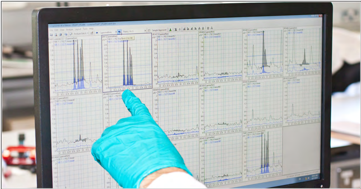
Figure 11: Sample chromatograms being compared with pesticide standards.

When a residue in a laboratory sample is identified by matching the retention time and the mass spectrum pattern with a standard, the amount of the residue in the sample is then quantified by running it against a series of standard mixtures of known concentrations. A select number of samples are also analysed for other pesticides which cannot be analysed using the multi-residue methods outlined above. These single residue methods (SRM) which may employ different extraction methods are used to analyse such pesticides as amitraz, glyphosate, paraquat and dithiocarbamates.