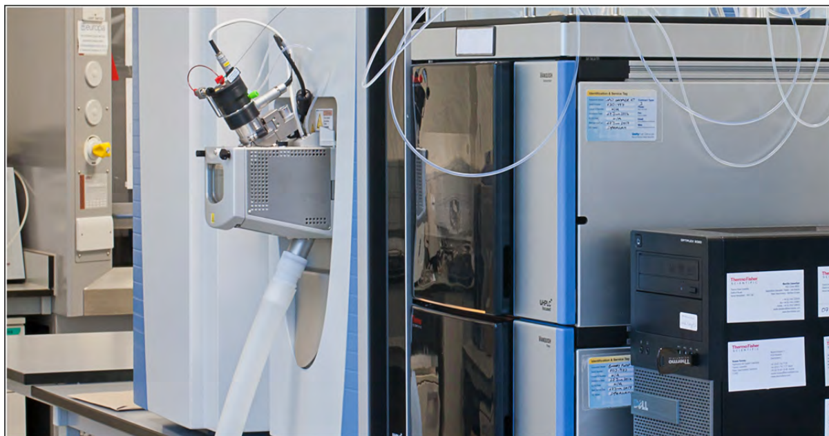
Figure 13: State-of-the-art advanced facilities are available in the Pesticide Control Laboratory such as high resolution accurate mass spectroscopy.

References to the analytical methods used in the laboratory are provided in Annex II at the back of this report.