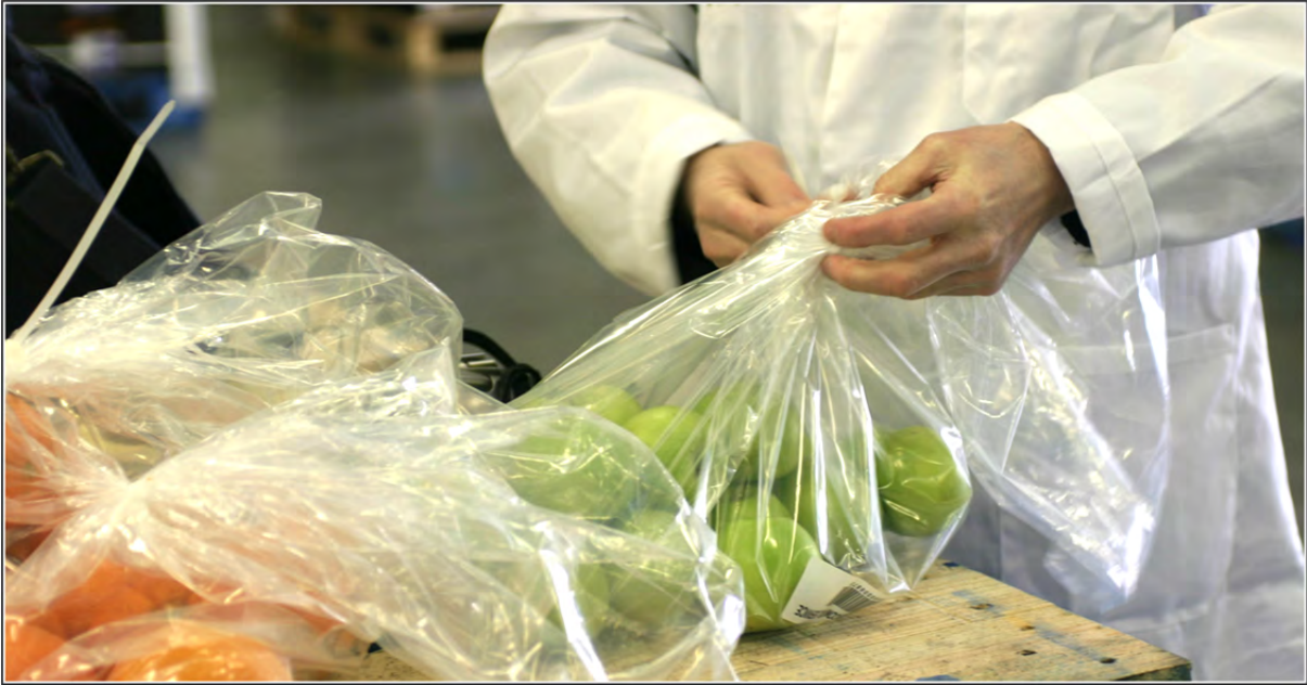
Figure 1: Department of Agriculture officer tagging fruit samples for pesticide residue analysis.

presence of pesticide residues in and on food. The results were also sent to the European Food Safety Authority and will be used as part of an EU wide annual report.