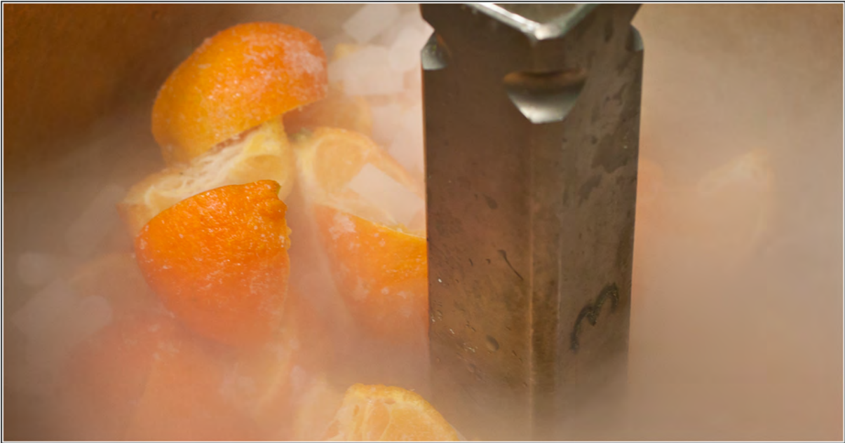
Figure 7: Chopped oranges in dry ice prior to blending and packaging.