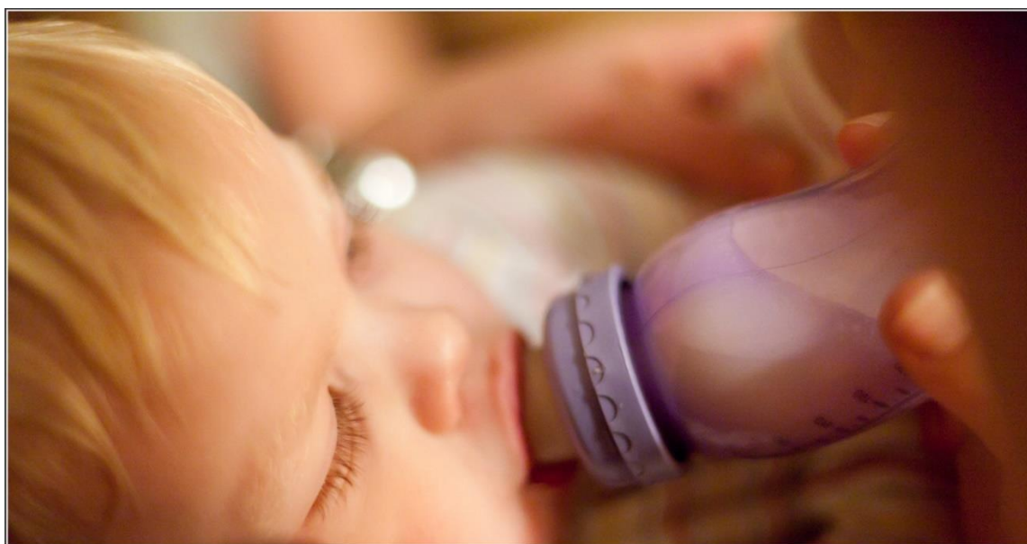
Figure 8: Feeding time with baby infant formula.

The samples were taken by officers of the Dairy Science Laboratory of DAFM. The legislation and the MRLs governing these infant samples are set in Commission Directive 2006/141/EC 4 with MRLs different to those established for the foods of plant and animal origin.