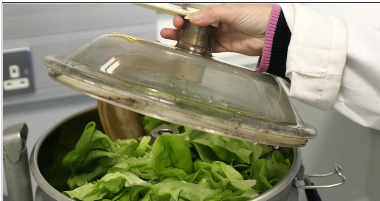
Figure 9: Lettuce sample prior to chopping and blending.

On receipt, the samples are logged into the laboratory system and prepared for residue analysis. The fruit and vegetable samples are blended or ground with dry ice (solid carbon dioxide), put into labelled sample bags and stored in a freezer at -18 °C prior to extraction and analysis.