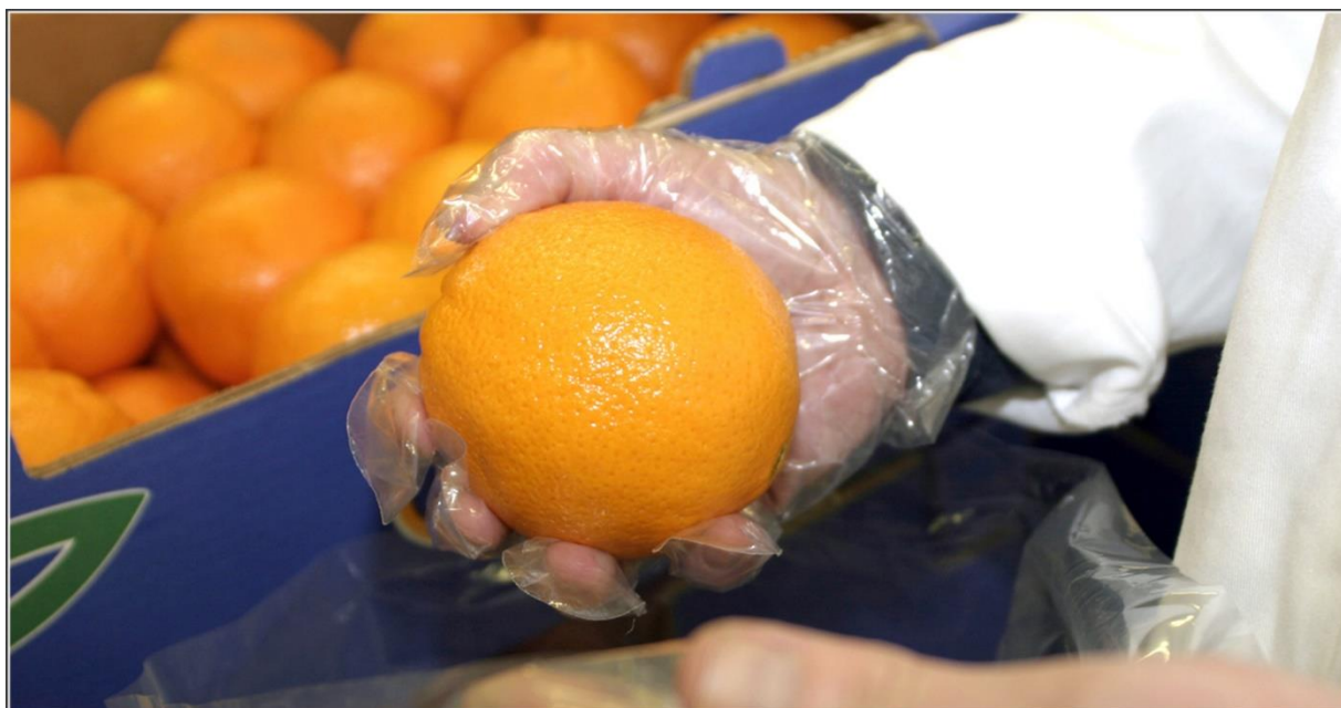
Figure 6: The monitoring programme covers several food groups: fruit and vegetables, cereals, food of animal origin and baby food.

The programme is designed to monitor different food groups for which MRLs have been established: fruit and vegetables, cereals, food of animal origin and baby food. It involves sampling of produce at distribution outlets, collection, storage, processing or slaughter premises and the analysis of those samples for the presence of residues of up to 470 pesticides and metabolites as well as 7 PCB congeners.