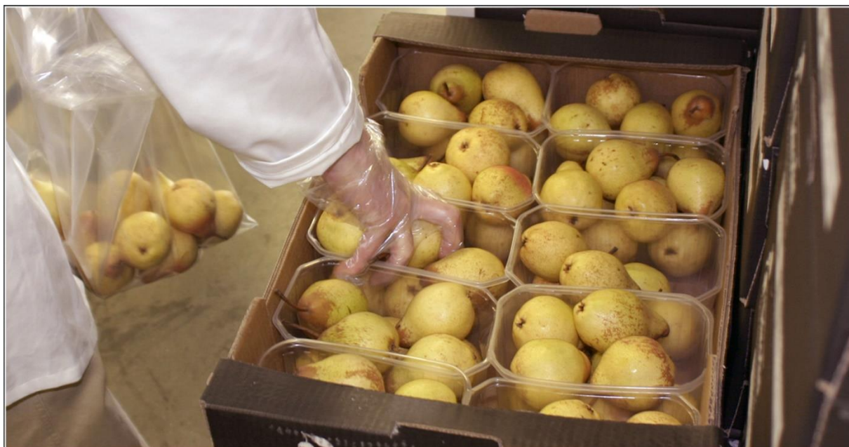
Figure 4: Department of Agriculture officer collecting fruit samples for pesticide residue analysis.

The Irish registration system specifies the timing, frequency, rates and the crops on which the pesticide may be used. Use of non-registered pesticides is an offence.