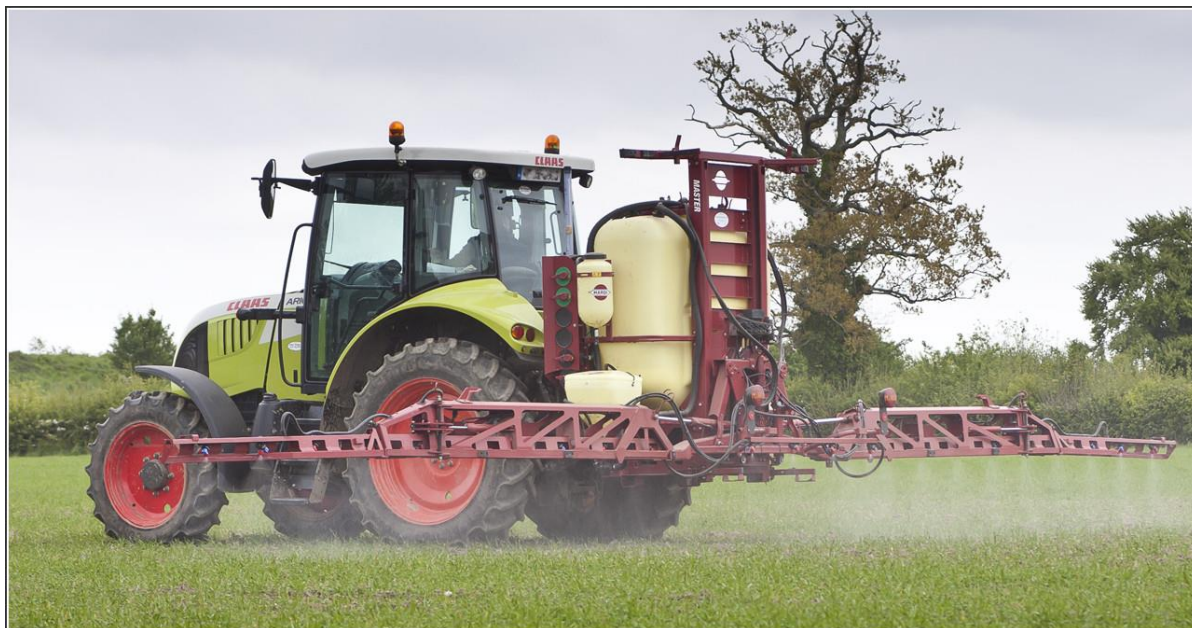
Figure 3: The application of plant protection products to a growing crop.

Pesticides comprise plant protection products and biocides. Plant protection products are required to protect crops and plant products from damage caused by insects, fungi, weeds and other pests. Production and distribution of sufficient volumes of food to meet consumer demands of quality at reasonable price is not possible without their use. Biocidal products are essential for disinfection of surfaces, implements and machinery used in the food industry and to inhibit the action of a range of harmful organisms.