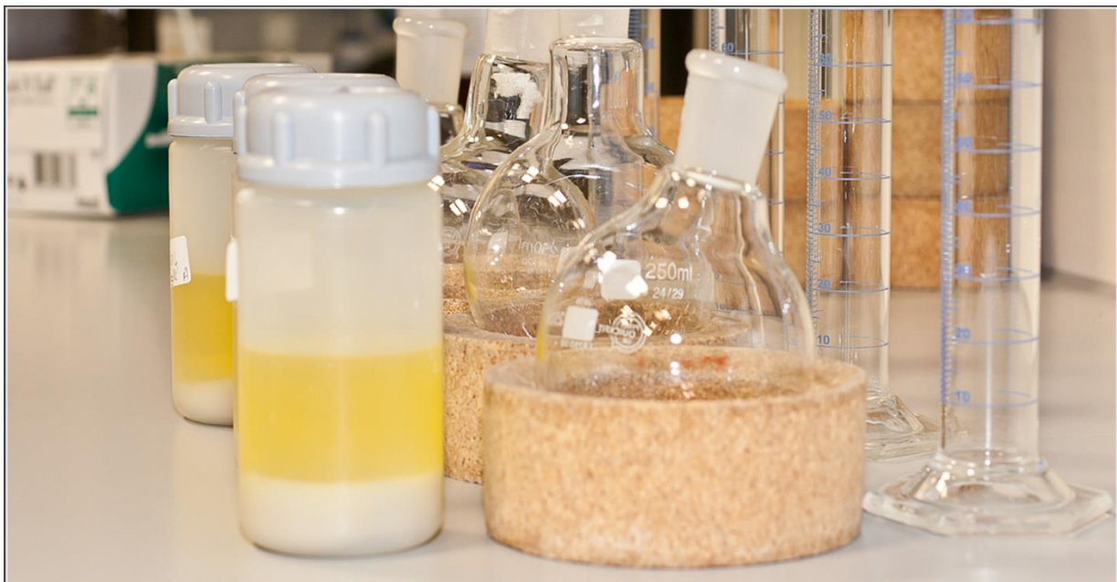
Figure 12: Sample material following the first chemical extraction, ready for clean-up steps.