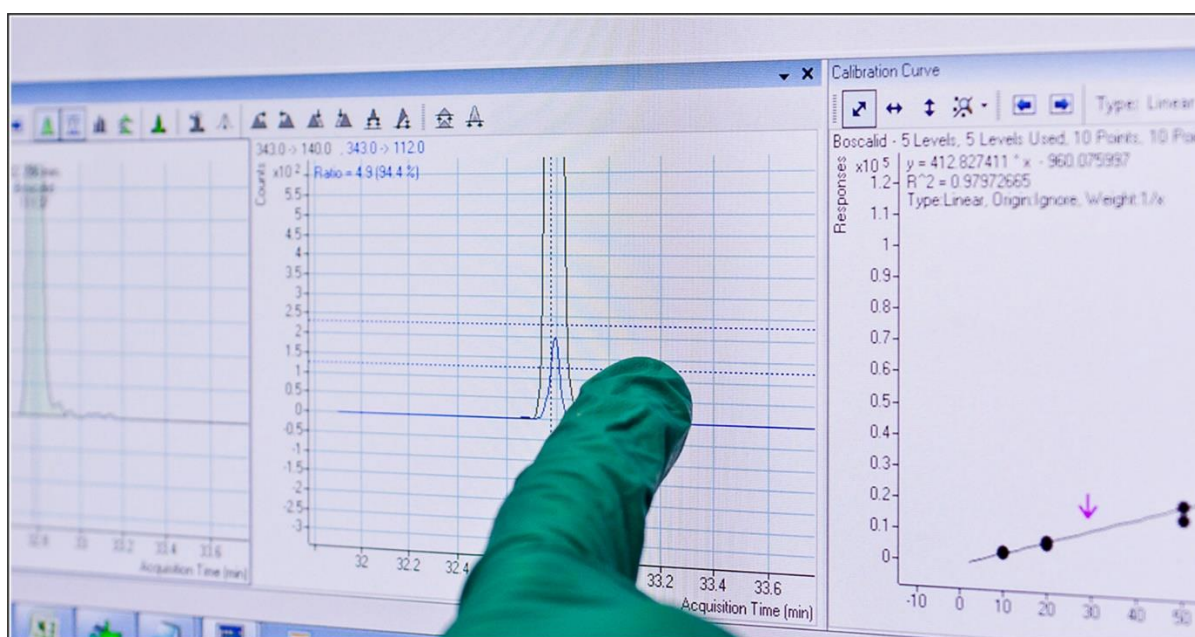
Figure 15: Residue identification and quantitation.

Some pesticides break down to give metabolites and in several cases these are summed to give a combined residue result and compared against the MRL using the residue definition established in legislation. An example is DDT which can consist of up to 6 breakdown products: o,p'-DDD, p,p'-DDD, o,p'-DDE, p,p'-DDE, o,p'-DDT and p,p'-DDT. The residue definition is the sum of these products expressed as DDT. The overall number of 470 pesticides analysed for in 2020 refers to the compounds analysed including metabolites as listed in Annex I.