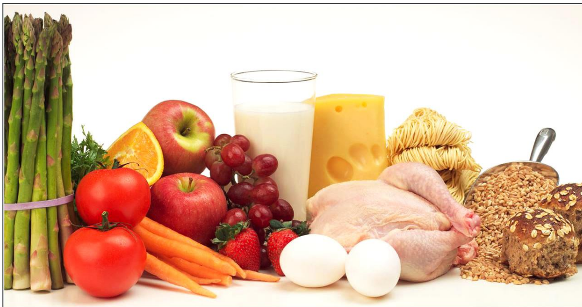
Figure 1: A wide range of food samples are targeted and sampled for pesticide residue analysis.

This report on the National Pesticide Residues Control Programme, carried out in 2020 by the Department of Agriculture, Food and the Marine (DAFM), provides details on pesticide residues detected in food commodities available on the Irish market. The Programme enforces EU legislation establishing the maximum permitted concentration of pesticide residues in food, or Maximum Residue Levels (MRLs), and aims to ensure that consumers are not exposed to unacceptable risks from pesticide residues.