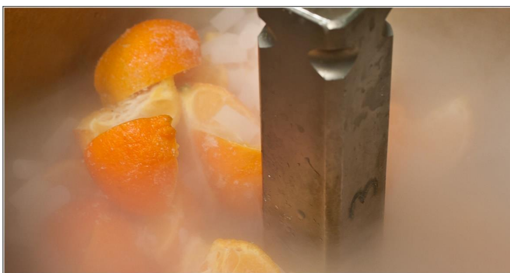
Figure 10: Chopped oranges in dry ice prior to blending and packaging.