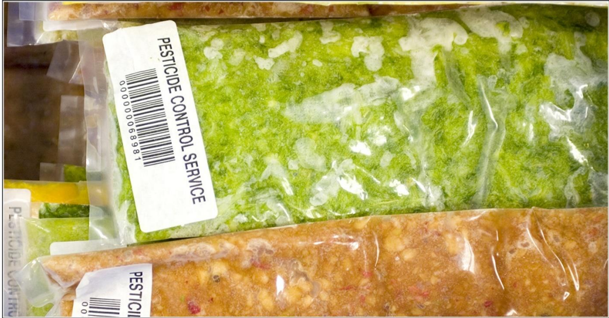
Figure 11: Frozen laboratory samples.

At the extraction stage, the ground up sample is taken out and a measured amount is extracted with organic solvents, cleaned up if required and injected into one of two chromatographic systems- GC/MS/MS (gas chromatography with tandem mass spectrometry) and/or LC/MS/MS (liquid chromatography with tandem mass spectrometry).