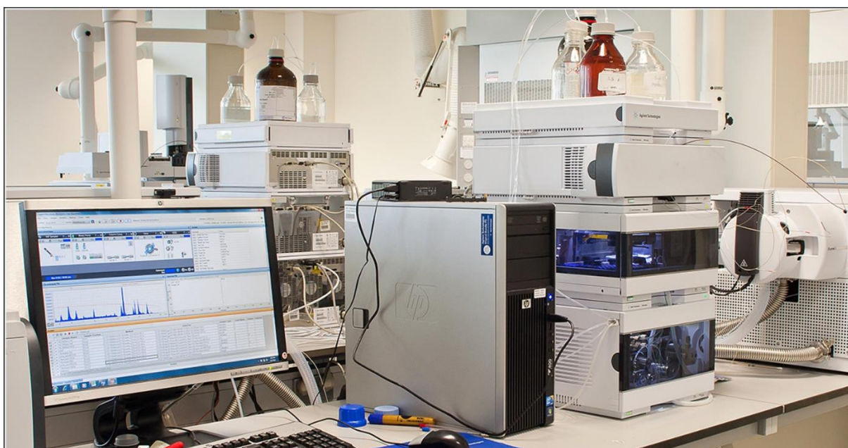
Figure 5: Pesticide Control Laboratory with liquid chromatographic systems for sample analysis.

The national pesticide residue control programme for pesticide residues is undertaken by the PCD (Pesticide Control Division) with laboratory support provided by the Food Chemistry Division of the Department of Agriculture, Food and Marine. The programme implements the requirements of Regulation (EC) No. 396/2005, and takes into account the requirements set out in the EU “ coordinated multi-annual Community control programme for 2020, 2021 and 2022 to ensure compliance with maximum levels of, and to assess the consumer exposure to pesticide residues in and on food of plant and animal origin ”, (Commission Implementing Regulation (EU) No. 2021/601). The requirement of the monitoring of food of animal origin for Directive 96/23/EC is also taken into consideration with respect to the determination of organochlorine and organophosphorus pesticides.