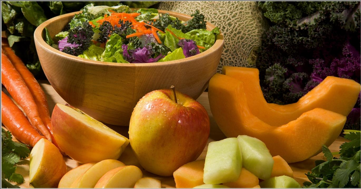
Figure 17: The monitoring system ensures that food produced in the EU is safe for consumers to eat.

The laboratory participated in all five of the EU Proficiency studies organised, on behalf of the EU Commission, by the European Union Community Reference Laboratories (EU-RL) in the pesticide area. Routine quality assurance procedures are followed within the laboratory in accordance with the requirements specified to maintain accreditation to the ISO 17025 standard.