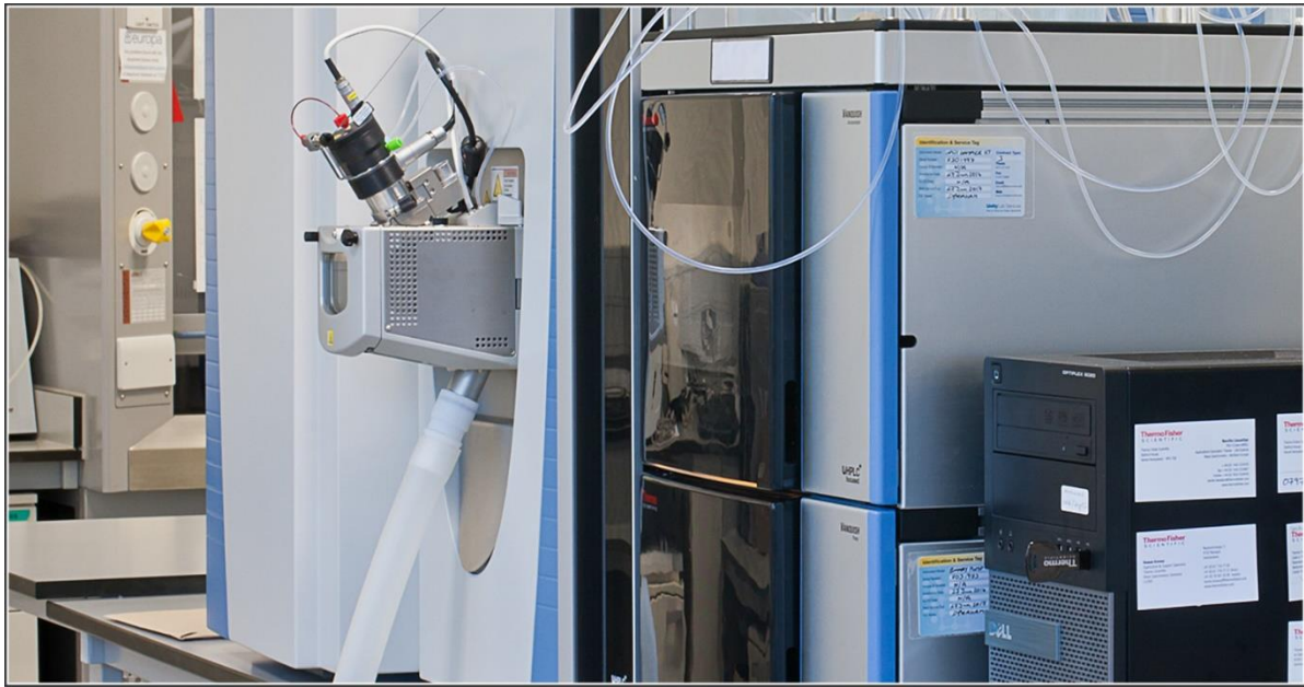
Figure 16: State-of-the-art advanced facilities are available in the Pesticide Control Laboratory such as accurate, high resolution mass spectroscopy.