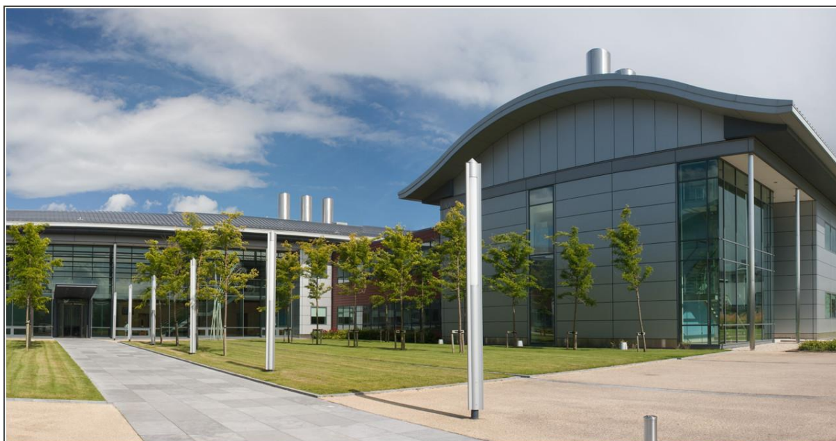
Figure 2: The Pesticide Residues Laboratory is part of the Agrilabs Building at Backweston Campus.

pesticide and chemical residues at the Food Chemistry Division in Backweston, County Kildare. The laboratory has continued to maintain and extend its accreditation status with the Irish National Accreditation Board.