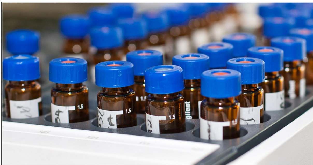
Figure 13: Glass vials containing samples for automated injection onto analytical equipment.

These analytical techniques allow a large number of pesticide residues to be analysed at the same time. For these multi residue methods (MRM), mixes containing many pesticide standards are injected onto the chromatographic columns and the details of the individual standards eluting from the columns are recorded as unique mass spectral data.